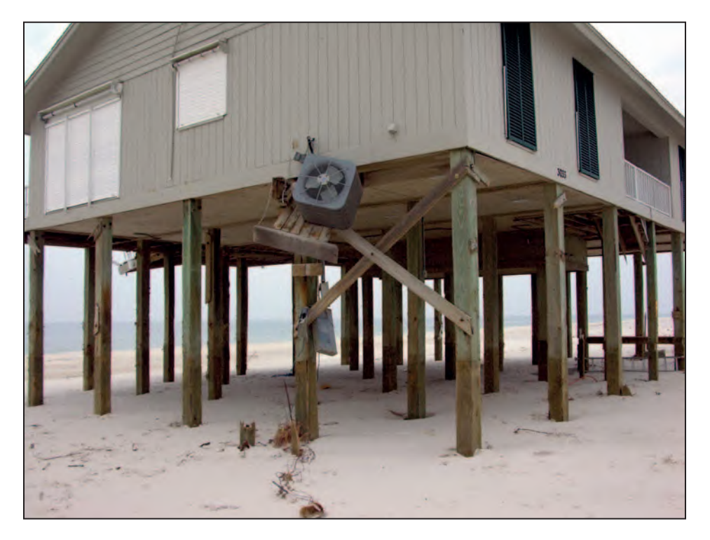
Figure 12-3. Small piles supporting a platform broken by floodborne debris

In Zone A, mechanical equipment must be elevated to the DFE on open or closed foundations or otherwise protected from floodwaters entering or accumulating in the equipment elements. For buildings constructed over crawlspaces, the ductwork of some heating, ventilation, and air-conditioning systems are routed through the crawlspace. The ductwork must be installed above the DFE or be made watertight in order to minimize flood damage. Many ductwork systems today are constructed with insulated board, which is destroyed by flood inundation.