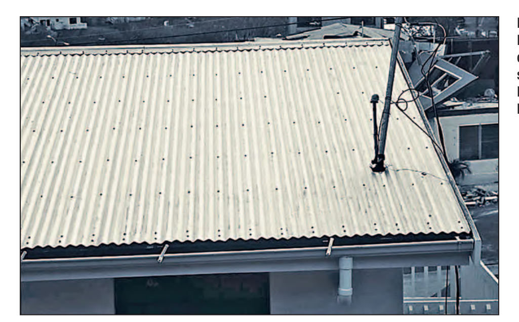
Figure 12-6. Damage caused by dropped overhead service, Hurricane Marilyn (U.S. Virgin Islands, 1995)