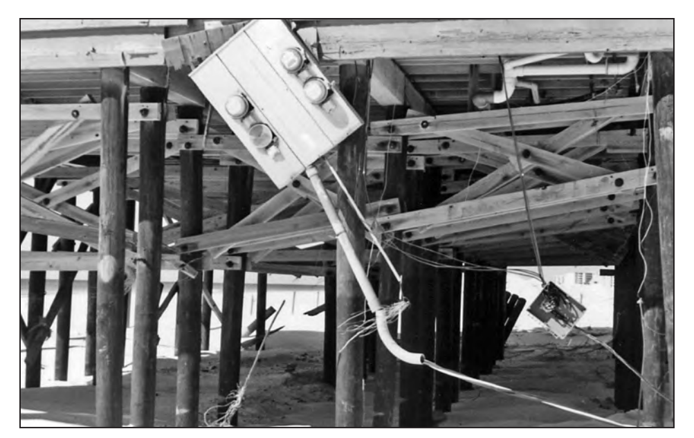
Figure 12-4. Electric service meters and feeders that were destroyed by floodwaters during Hurricane Opal (1995)

that produce 4 feet of flooding can cause water to enter the meter socket and disrupt the electric service. When a meter is below the flood level, electric service can be exposed to floodborne debris, wave action, and flood forces. Figure 12-5 shows an electric meter that is easily accessible by the utility company but is above the DFE.